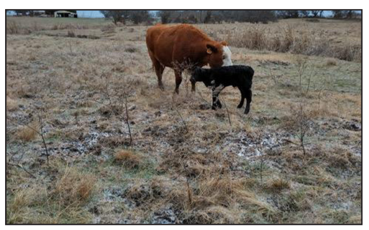
Newborn calf when it was 10 degrees.